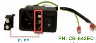
PN: CB-643EC-RS AC input cable with fuse, 20cm