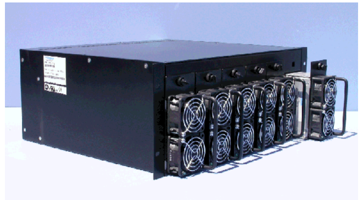
GPHP 600 shown in CRA rack

The GPHP Series are universal input AC/DC power supplies with power factor correction (PFC) with up to 700 Watts output power. The GPHP product incorporates 'hot-swap' capabilities and a handle. The series is approved to EN60950 to reduce design-in time and end system compliance costs