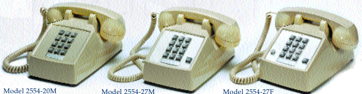
Model 2554-20M Basic